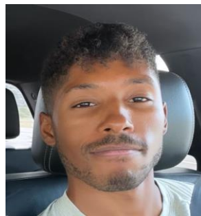
Bryce Jackson Events