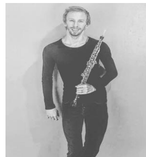
Luca de la Florin Communications